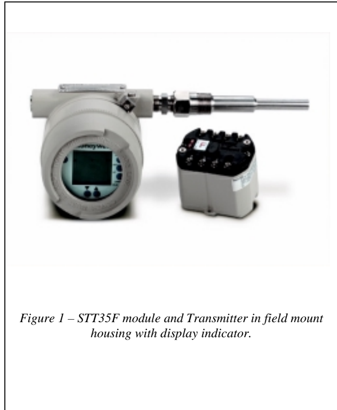
Figure 1 – STT35F module and Transmitter in field mount housing with display indicator.

The STT35F output conforms to the low speed (H1) of the Fieldbus Physical Layer specification IEC 61158-2 (1993). The other protocol layers conform to the FOUNDATION™ Fieldbus section of the 8 part IEC 61158 standard. This is supported by all the worldwide instrumentation suppliers and enables multidrop field instruments to be powered down a single wire pair and communicate measurement, control, configuration and diagnostic data at 31.25kbps.